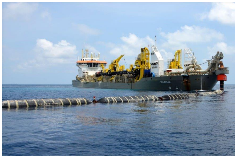
Figure 3: TSHD Oranje with Floating Line.